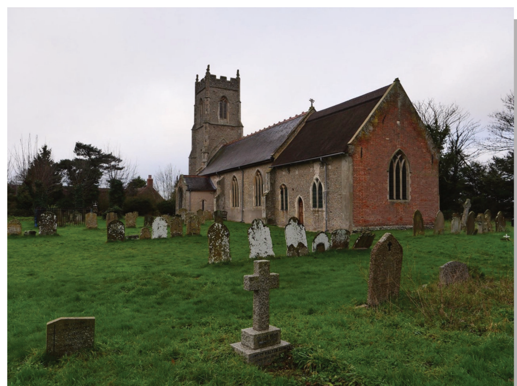
St Margarets Church, Witton